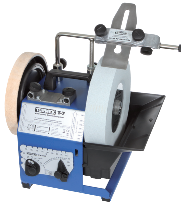
TORMEK T-7 (no longer available)